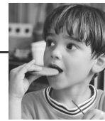
Number of Children Qualifying for the Free and Reduced Price School Lunch Program Contra Costa, 1991–1998