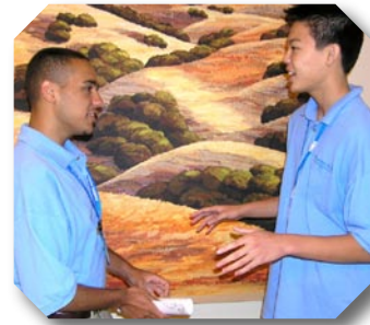
ROP Interns Kaiser Permanente