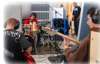
ROP Digital Recording Studio