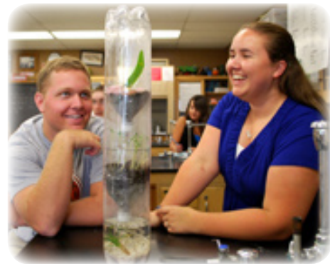
ROP AP Environmental Science