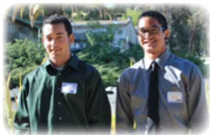
Walnut Creek Honda