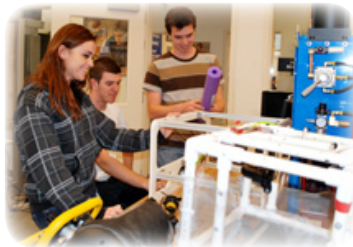
ROP Principles of Engineering