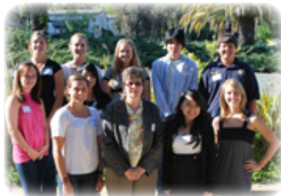
John Muir Health