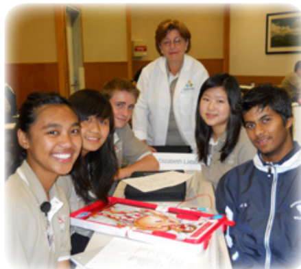
“Operation Emergency” a success!