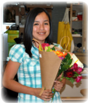
Mt. Diablo High recipient