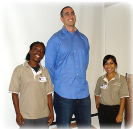
Graduate returns to John Muir Health as guest speaker