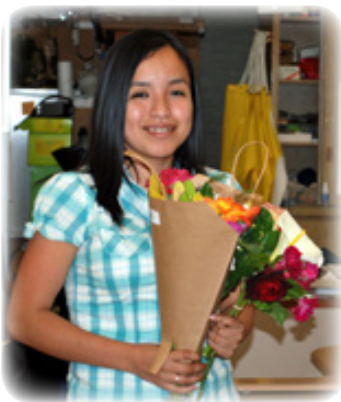
Mt. Diablo High recipient